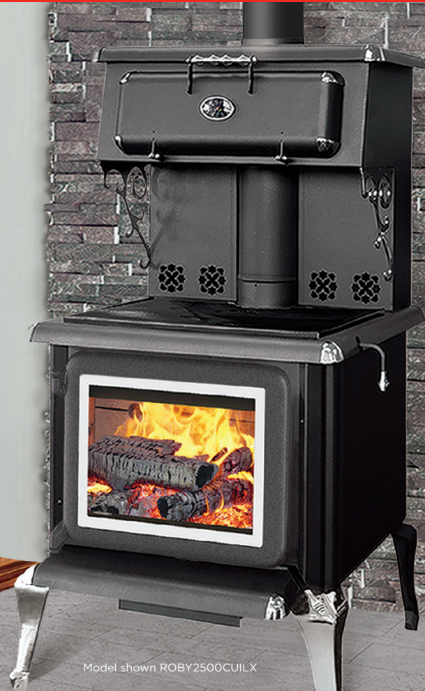
Model shown ROBY2500CUILX

TREAT YOURSELF WITH PEACE OF MIND WITH THIS DEVICE PROVIDING 95,000 BTU AND EQUIPPED WITH A FOOD WARMER AND CAST IRON COOKING PLATE. MOBILE HOME APPROVED.