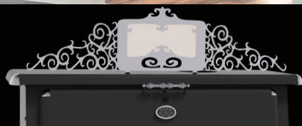
SMALL DECORATIVE CHROME-PLATED TOP WITH MIRROR, OPTIONAL