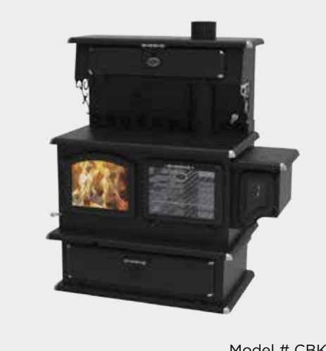
Model # CBKOC

Its design is both beautiful and convenient with its arched cast iron door on the firebox, squared door on oven side, storage drawer at the bottom, as well as chromed oven racks, corners, and ornaments. It provides up to 110,000 BTU (dry cordwood) and is EPA and CSA B415.1 certified (low emissions of 1.56 g/h). The model can accommodate logs up to 22" and includes outdoor air intake (optional ducting).